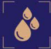
Sweet Ground Water