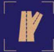
Blacktop Wide Roads