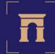
Grand Entrance Arch