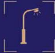
EB Street Light