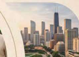
CITY ACCESS & LIFESTYLE