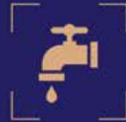
Water Pipeline & Drainage Systems