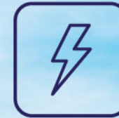
3 Phase EB Line