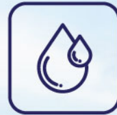
Sweet Ground Water