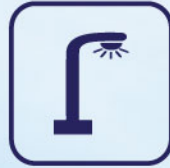
EB Street Light