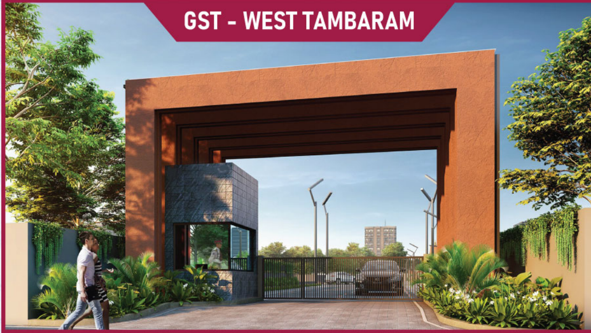
GST - WEST TAMBARAM