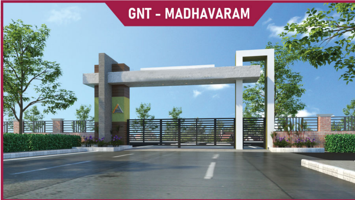
GNT - MADHAVARAM