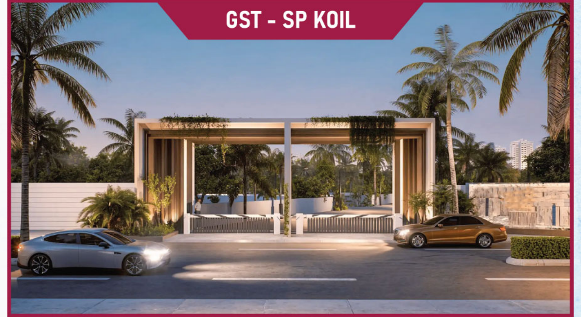
GST - SP KOIL