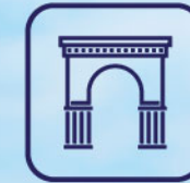
Grand Entrance Arch