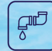
Water Pipeline & Drainage Systems